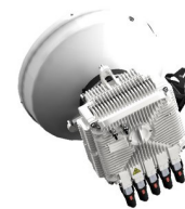
UBT-T with integrated antenna